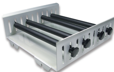
400.101.112 / 157 Universal Platform