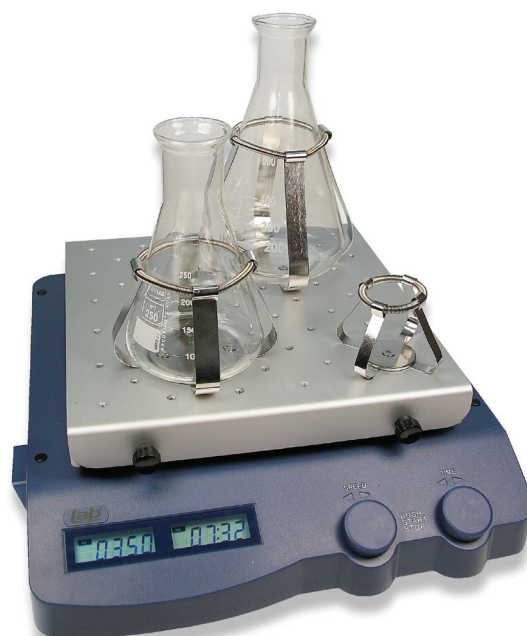
400.101.100 pictured with 400.101.111 Fixing Clip Platform, Fixing Clips & Flasks all sold separately