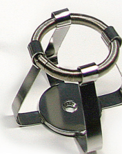
400.101.200 25mL Flask