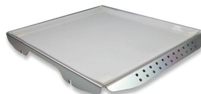
400.101.113 / 158 Dish Platform