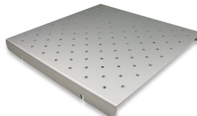
400.101.111 / 156 Fixing Clip Platform