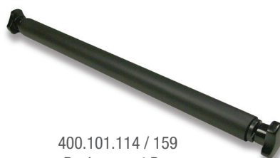
400.101.114 / 159 Replacement Bar