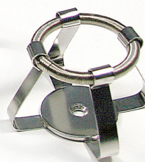
400.101.201 50mL Flask