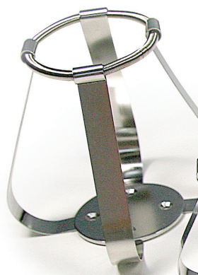
400.101.204 500mL Flask