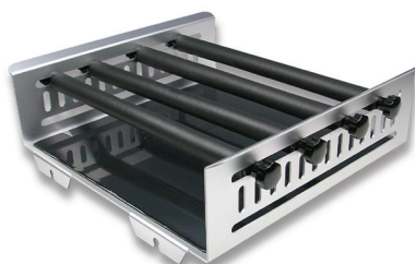
400.101.110 / 155 Universal Platform